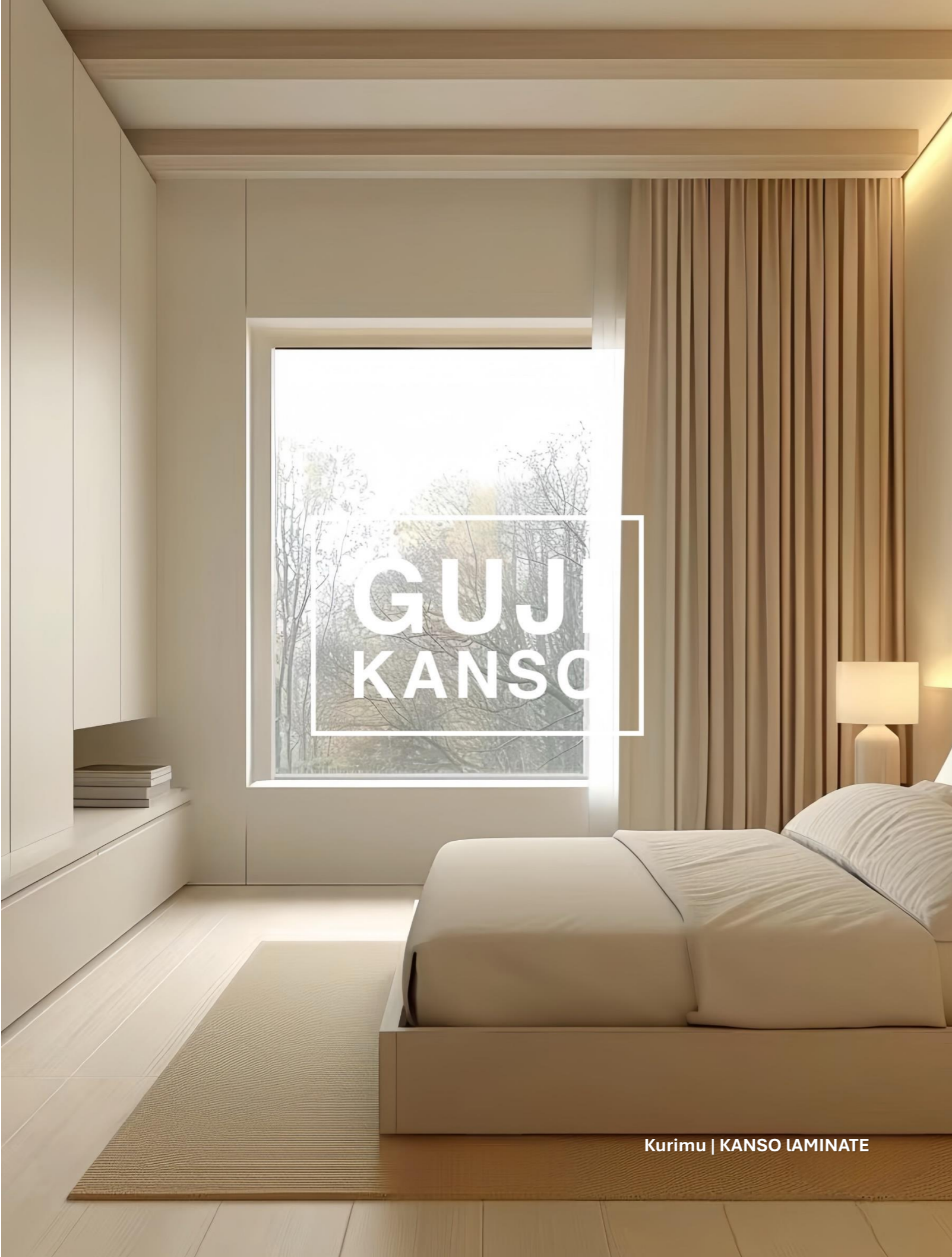
Kurimu | KANSO LAMINATE